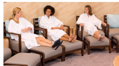
VITALITY AT SEA SPA AND FITNESS CENTER